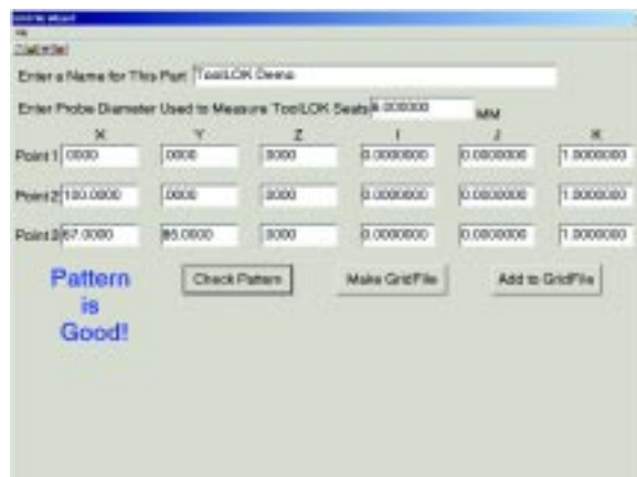
TooLOK™ wizard screenshot

The simple-to-use TooLOK™ wizard allows users to generate a LOK for a fixture, gage, part or tool. The LOK then serves as the reference between the part and its associated files.