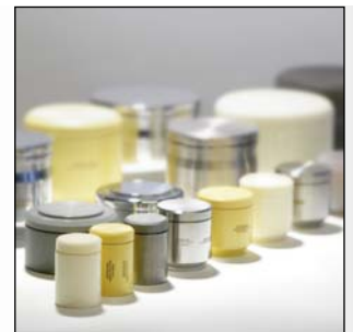
Particularly versatile: The FRITSCH grinding bowl programme