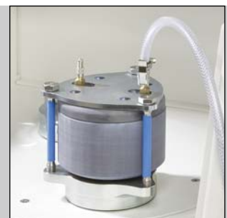
The PULVERISETTE 4 grinding in inert gas