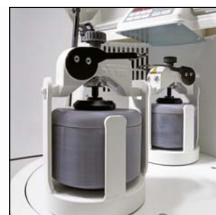
Also available: The P-5 classic line with 2 working stations