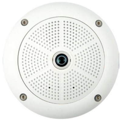
Q24 Standard Ø 160 mm