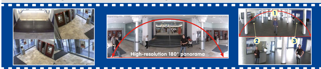
3 simultaneous views