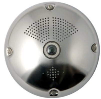
Q24 Standard Ø 160 mm Q24 Vandalism Ø 160 mm