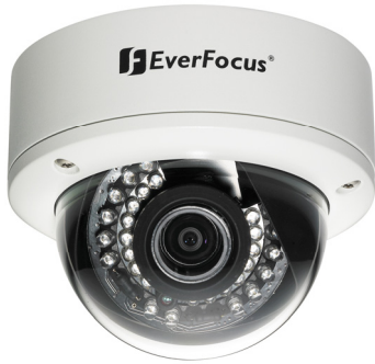
EHD 630 s – 8,5mm (1/3") vandal-proof outdoor day/night 3-axis gimbal mechanism dome camera with IR LED and D-WDR