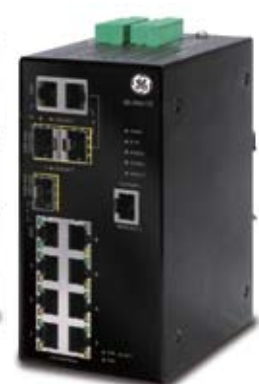
7-Port 10/100mbps Plus 3-Port Gigabit SFP Combo Managed Industrial Switch