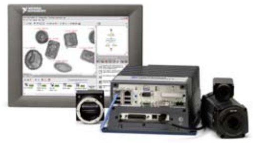
Figure 2. You can configure the EVS-1464RT using Vision Builder AI or program the system using the Vision Development Module.

With the National Instruments machine vision software approach, you can configure your inspection with easy-to-use, stand-alone NI Vision Builder for Automated Inspection software or program it for more advanced customization using the NI Vision Development Module. Both options feature hundreds of built-in machine vision and image processing functions you can use to enhance images, check for presence, locate features, identify objects, and measure parts.