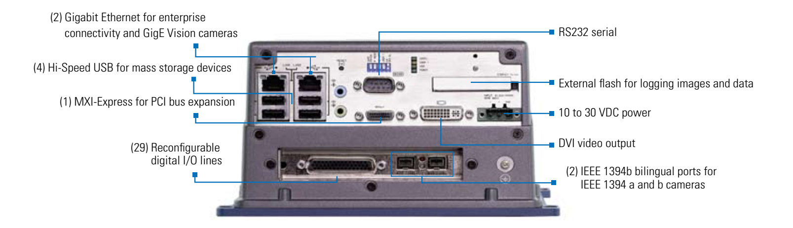
Figure 1. NI EVS-1464RT Connectivity Options