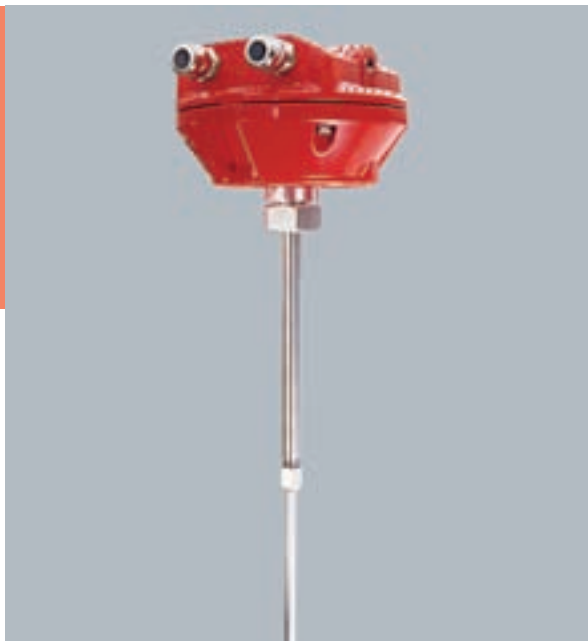
UniVario WMX5000 FS

Flame detectors react to optical radiation and analyse specific wave lengths. They are installed wherever open flames are likely to develop quickly.