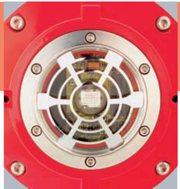
UniVario FMX5000 UV