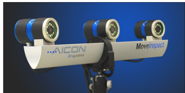
• MoveInspect for 3D measurements of dynamic processes

The applied high speed digital camera TraceCam F can also be used for other motion analyses dealing with a big number of measuring points. When conducting a 3D analysis of other objects than the engine, at least two cameras are necessary that monitor the part from different viewing angles. The repertoire comprises e.g. door slam tests, closure tests of hoods, convertible tops, and windows, or material tests. Detailed information is available in our product brochure MoveInspect.