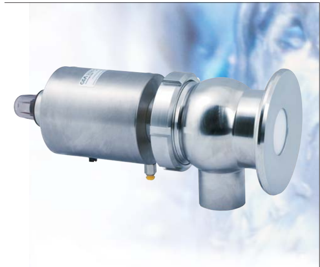
VESTA® Tank Bottom Valve, with weld-on housing