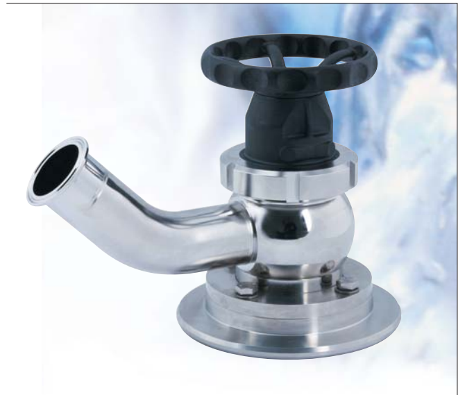
VESTA® Tank Bottom Valve, with flange-on housing

Various application options allow for many process opportunities.