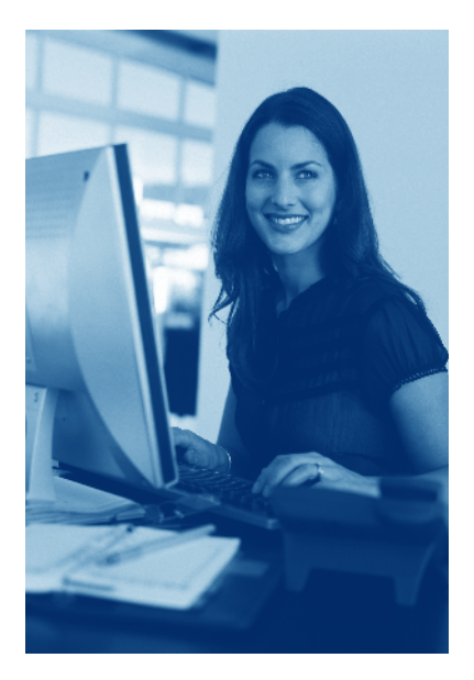
With LEGIC Studio the handling and creation of the content of LEGIC credentials and Master-Tokens is made easy.