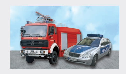
Introduction/Monitoring of corrective (assistance) actions