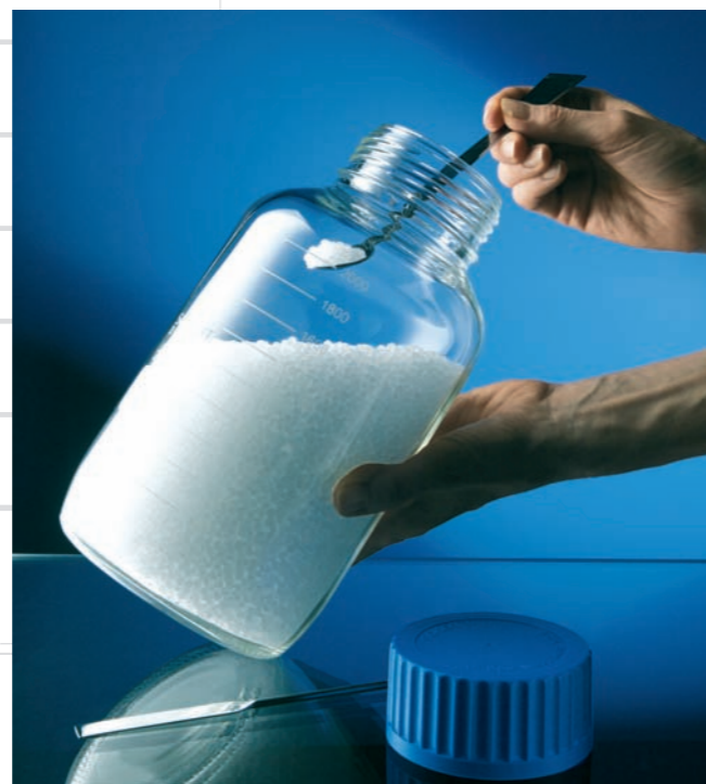
Easy media removal

Clicking sound – an aural and tactile 'clicking' gives positive confirmation that the bottle is firmly closed.