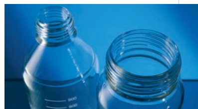
Comparison of GL 45 to GLS 80 necks - the benefits are immediately visible

Sterilizable – excellent thermal properties of DURAN® allow such procedures as autoclaving and dry sterilization with the ability to re-use an unlimited number of times.