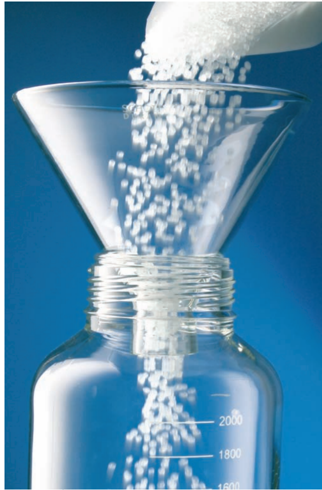
Easy and safe filling

DURAN® GLS 80 wide neck bottles offer a versatile solution for laboratory and industrial applications. Their flexibility and unique design enhance safety and efficiency whether filling or pouring in the laboratory, in the field or in production, whether for sampling, preparation, storage or product packaging. They may be used with a huge range of contents at reduced, ambient or high temperatures.