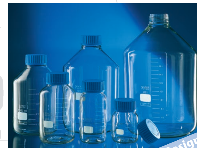
Choose from six different bottle sizes