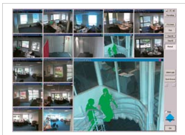
XPP Live Monitor