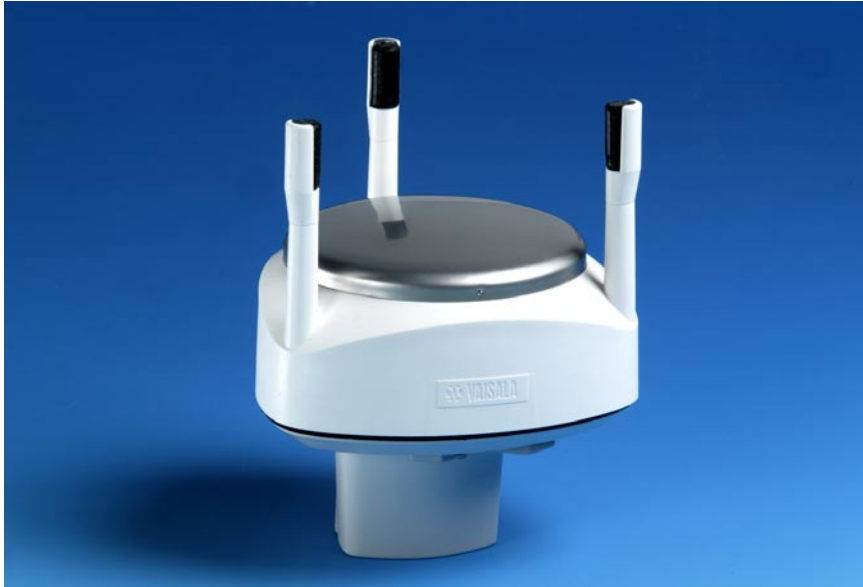
The Vaisala WINDCAP® Ultrasonic Wind Sensor is designed for demanding applications where stable and inexpensive wind measurements are required.