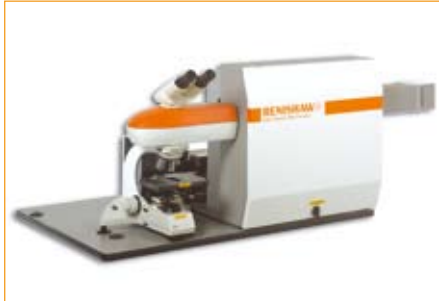
The inVia Reflex Raman microscope has all the proven performance of Renishaw's renowned RM Series Raman microscope, with the addition of full automation

Intermediate configurations can be matched to satisfy customer's needs fully, without compromising the ability to upgrade later to a fully automated inVia Reflex Raman microscope.