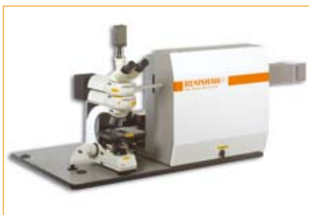
The inVia Raman microscope is ideal for those who want an entry-level system with the ability to upgrade to a fully automated inVia Reflex Raman microscope at a later date (Model illustrated includes optional eyepieces)