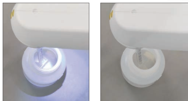
The PIPETBOY pro with the LED switched on (left) makes the bottom of the bottle clearly visible compared to the bottle that is not illuminated (right).