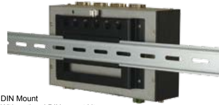
DIN Mount With optional DIN mount kit