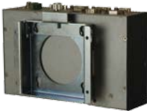
VESA 75 Mount