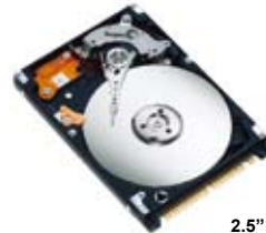
2.5" Hard Drive Bracket IDE interface only