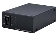
Camera Adaptors DC-700 DC-700CE