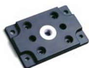
Tripod Adaptor VCT-ST701