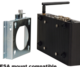
VESA mount compatible (mounting kit included)